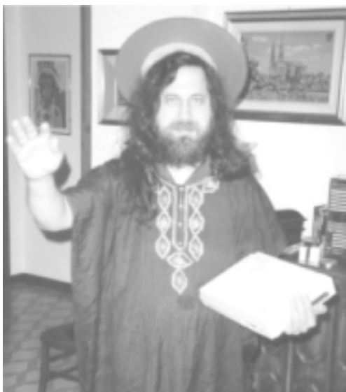
Stallman dressed as St. Ignucius.

The laughter turns into full-blown applause after a few seconds. As audience members clap, the computer disk on Stallman's head catches the glare of an overhead light, eliciting a perfect halo effect. In the blink of an eye, Stallman goes from awkward haole to Russian religious icon.